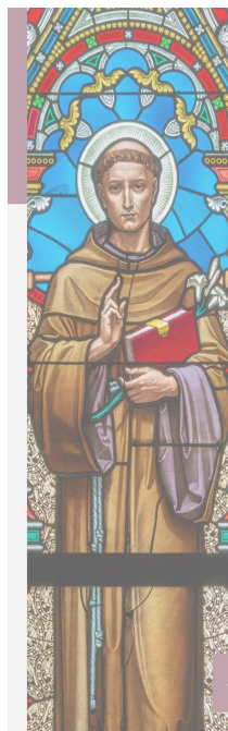
St. Anthony of Padua, Priest and Doctor of the Church - Feast Day June 13

"Charity is the soul of faith; it gives it life; without love, faith dies."