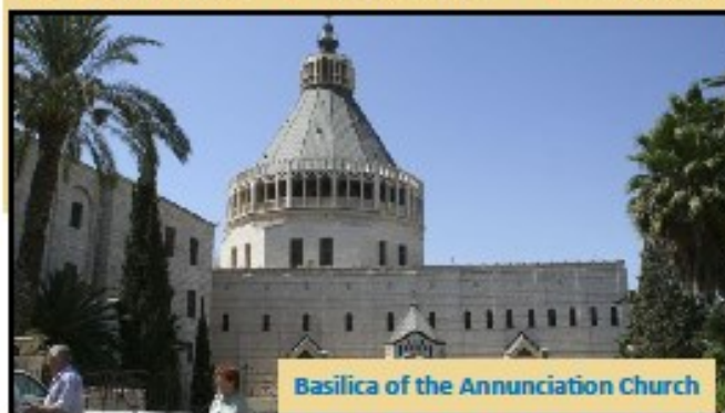
Basilica of the Annunciation Church

+ Tel Aviv + Nazareth + Cana + Sea of Galilee + Jordan River + Mt. Tabor + Jerusalem + Gethsemane + Bethlehem + Jericho + Dead Sea + Mt. Zion + Holy Sepulcher