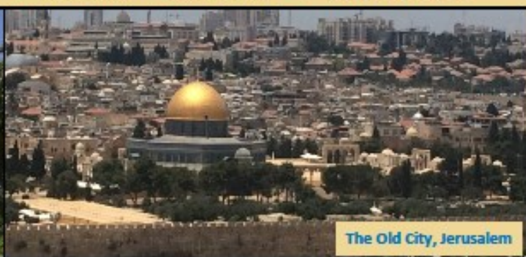
The Old City, Jerusalem

Come live, feel and EXPERIENCE the unforgettable Journey of Jesus Christ through a 10 day adventure in the Holy Land. A tour filled with life enriching and faith illuminating events that will strengthen your faith.