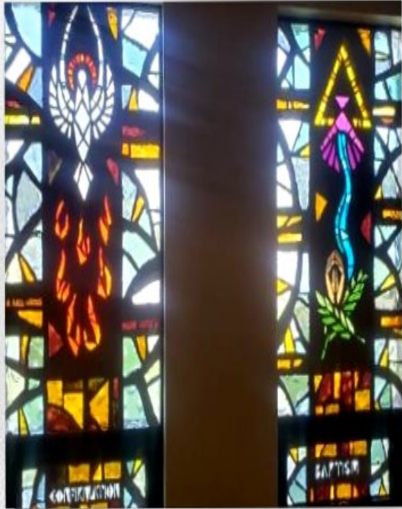
St Joseph's Catholic Church Chappell, Nebraska

FOR GOD DID NOT GIVE US A SPIRIT OF COWARDICE BUT RATHER OF POWER AND LOVE AND SELF-CONTROL.